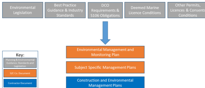
Plate 2.1: Sizewell C Project Environmental management system

2.4.5 Where the specific details of the proposed mitigation are yet to be determined, SZC Co. has committed to prepare further details, which will be approved by an the appropriate authority or group, such as East Suffolk Council (ESC) or the Environment Review Group (as set out in the Deed of Obligation, Schedule 17), and where relevant in consultation with other stakeholders.